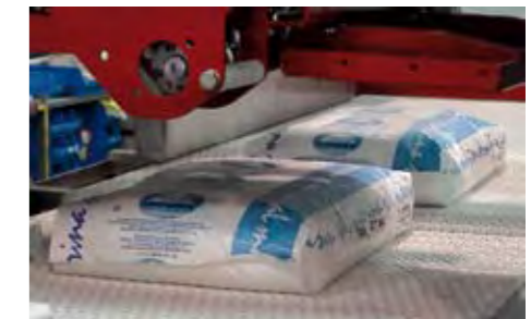
Bag turning by FLAP