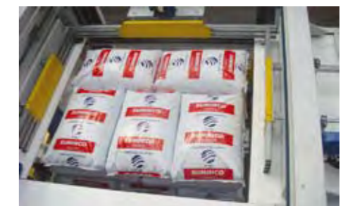
Motorized side plates for layer conforming