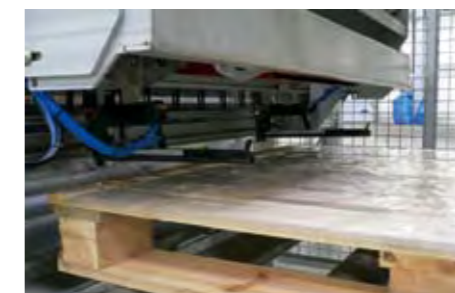
Automatic stapling system for film or sheet on empty pallet