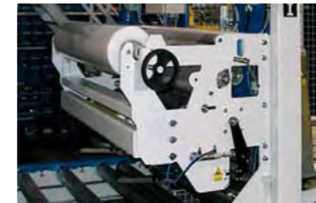
PE film dispenser