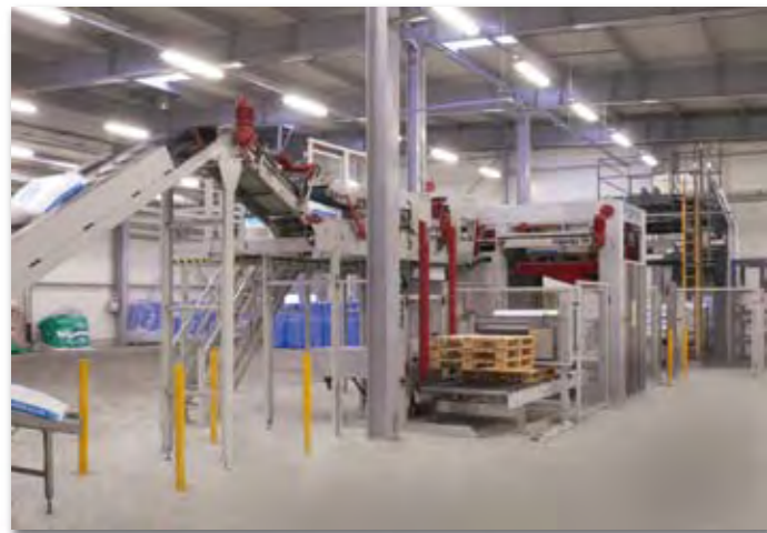
Whole palletizing and wrapping/hooding lines