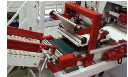
Special treatments for corrosive products