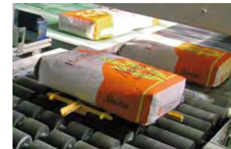
Bag turning by grid