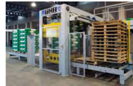
Automatic pallet dispenser