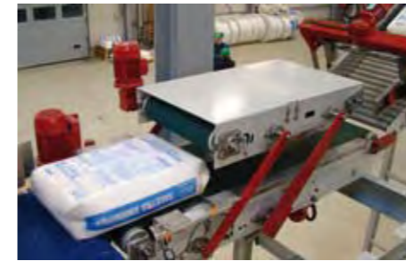
Motorized belt flattener