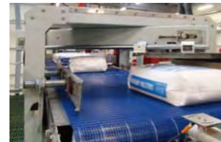
Special modules for high outputs