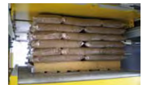
Top layer pressing