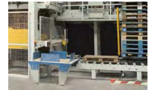
Carton sheet dispenser