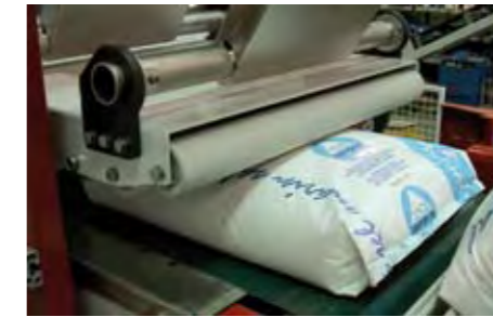
Idle rolls flattener