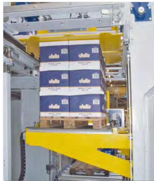
Palletizing of boxes