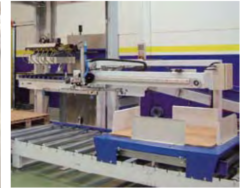
Carton sheet dispenser