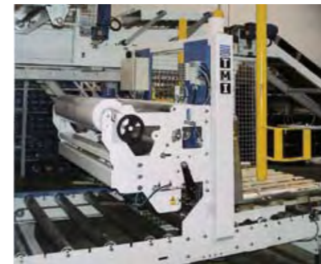
PE sheet dispenser