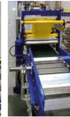
Bag conditioning by squared and idle rollers