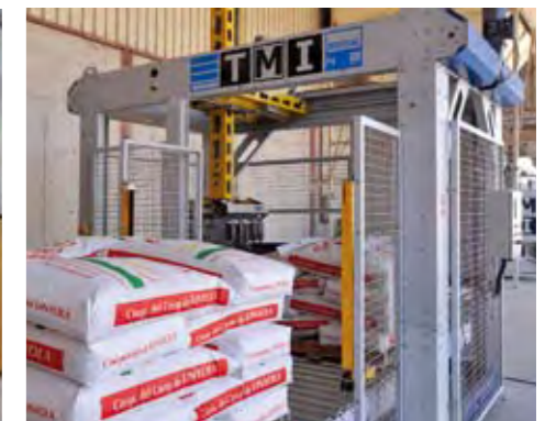
Full automatic line