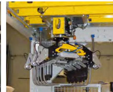
Versatile grips for bags and carton sheets