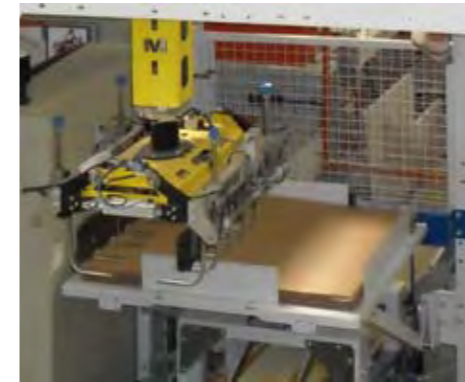
Carton sheet magazine