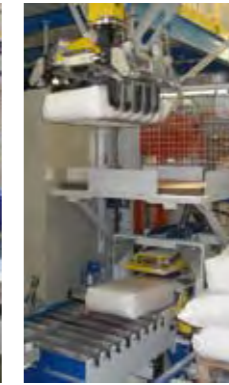
Bag conditioning by top flattening and vibrating