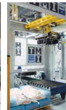
Palletizing on floor