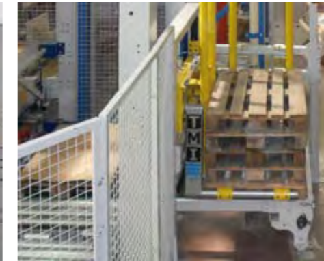
Automatic pallet dispenser