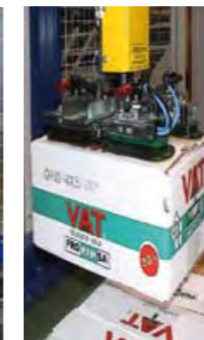
Grips for cases