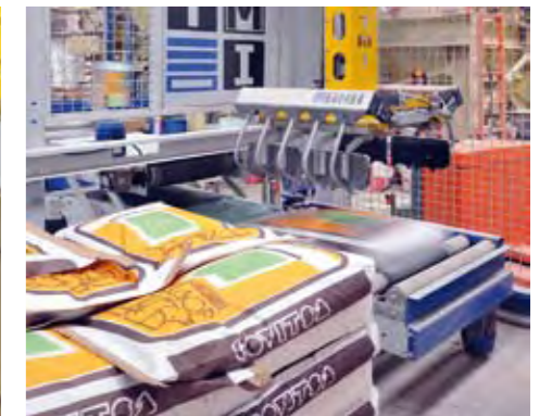
Bags handling grip