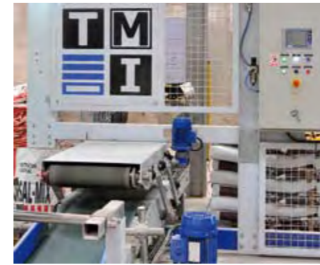
Bag flattener by motorized belt