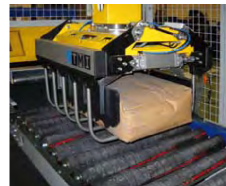
Roller conveyor for bags delivery